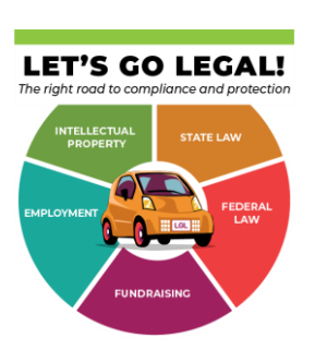
Let's Go Legal: The right road to compliance and protection. Created in partnership with Wayfind.

All of these include videos, guides, games, documents, and tools. Available in the Learning Library: